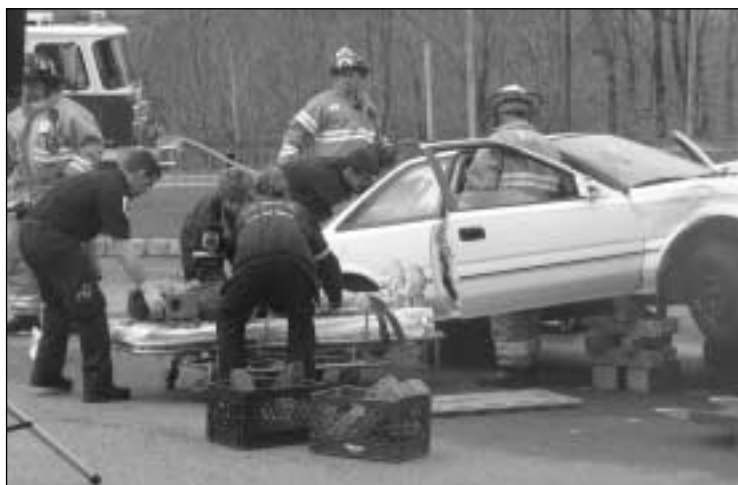
The Morris Township Department and The Morris Minute Men work to extricate the crash victims at the simulated Driving Under the Influence Crash at Delbarton High School.

Adults and adolescents need constant reminders that impaired driving can lead to tragic outcomes. This program engaged the students and teachers alike.