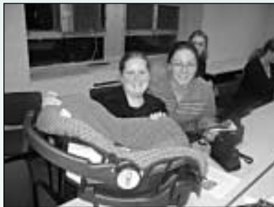
Au Pairs from Cultural Au Pair Participate in a Caregiver class at Morristown Memorial Hospital.

This year is the 15th anniversary of the National SAFE KIDS Campaign, the first and only national nonprofit organization dedicated solely to the prevention of unintentional childhood injury.