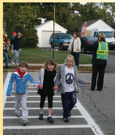
Together..... in the crosswalk!