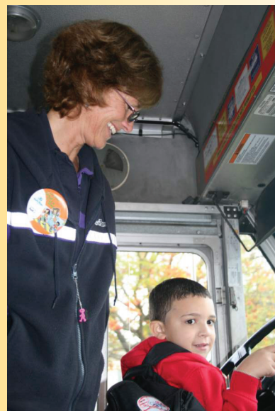
This student is getting a driver's view.

Prevention Works is the official triennial newsletter of Northern NJ SAFE KIDS/Safe Communities.